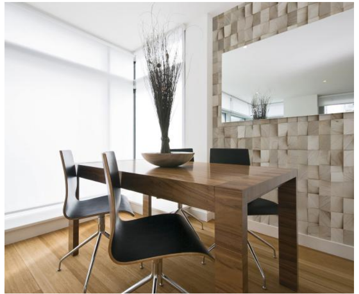
Offices - Acoustic ceiling & printed wall