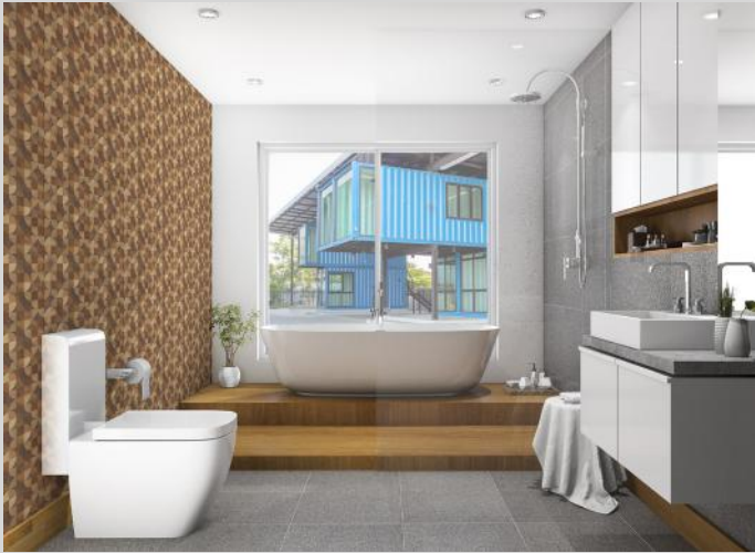
Residential - Bathroom - Acoustic ceiling and printed wall