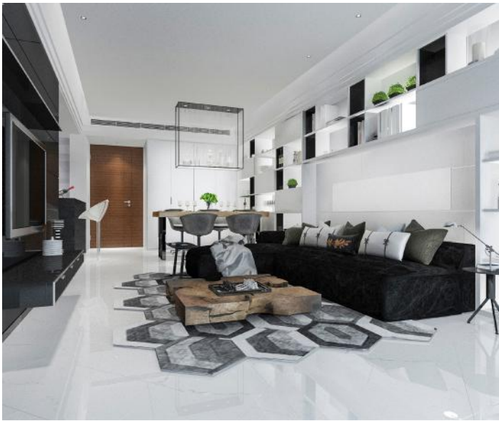
Private home - White ceiling