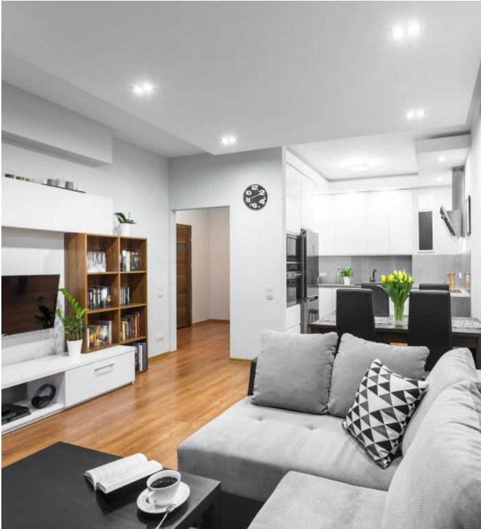
Residential - living room - White acoustic box with light integrations

...CLIPSO® benefits for walls and ceilings in modular constructions: