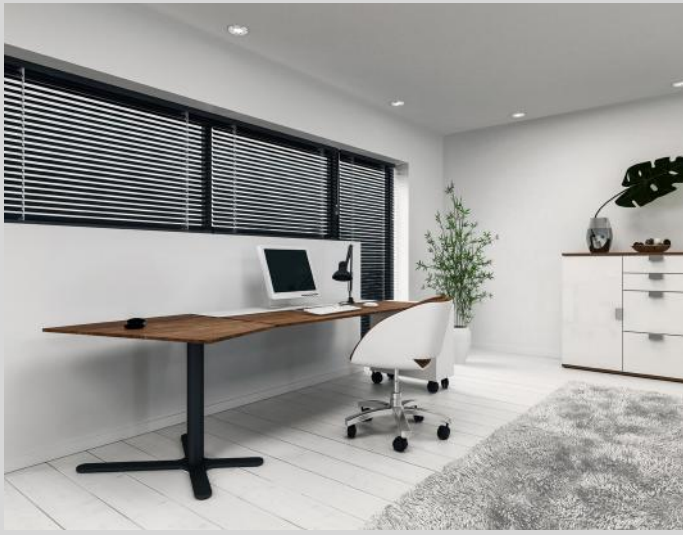
Desk - white ceiling and walls