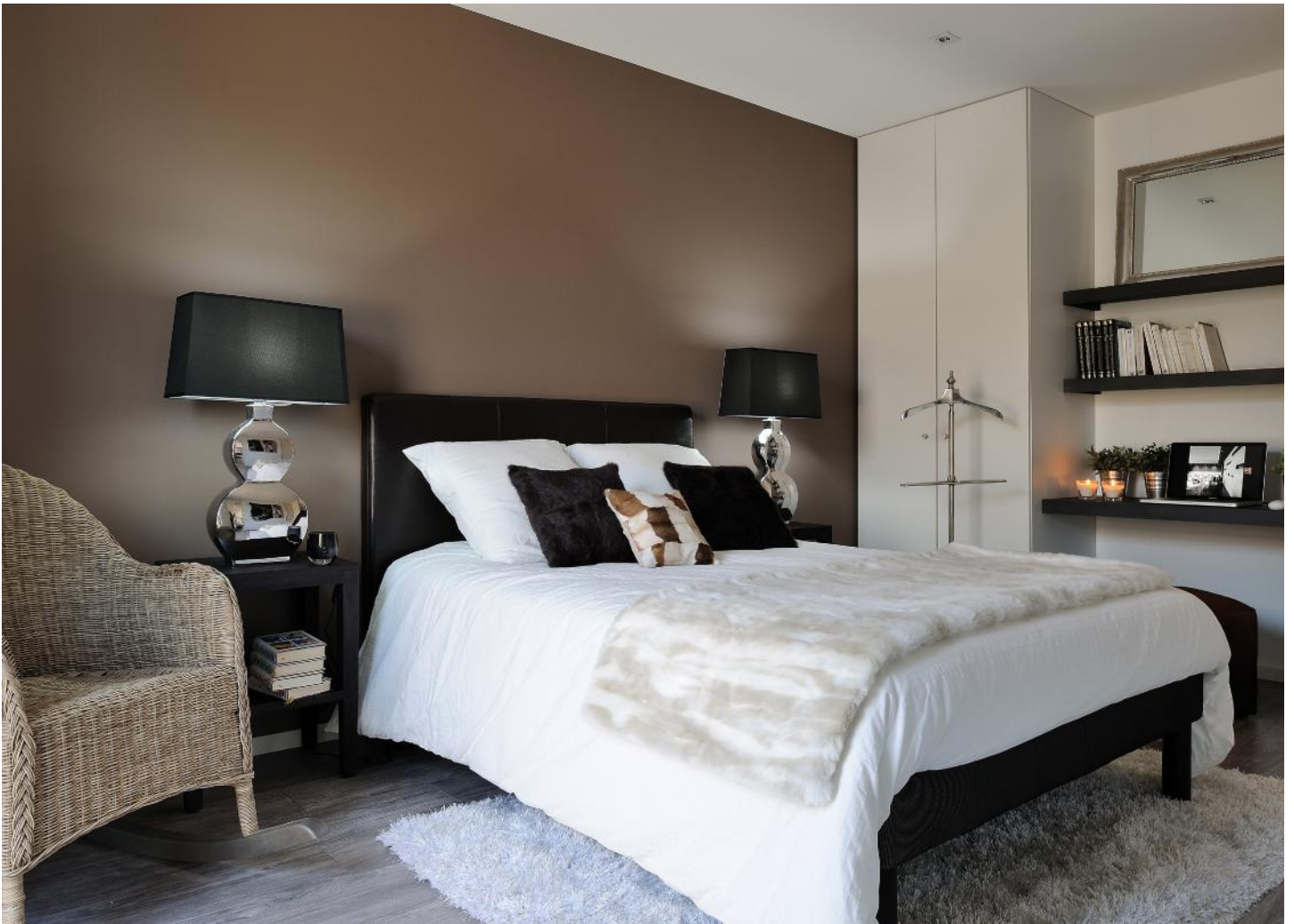
Apartment block - Bedroom - White acoustic ceiling and printed wall.