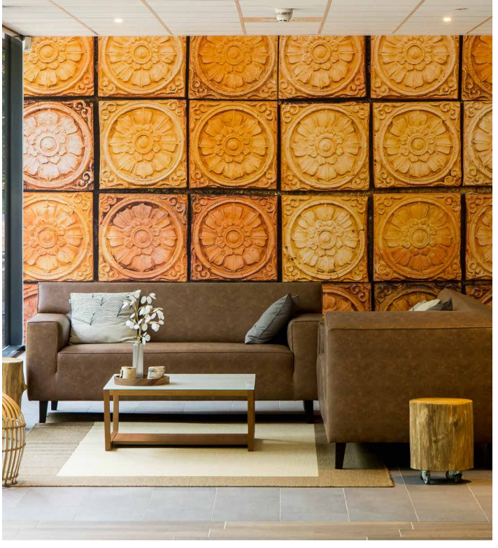
...CLIPSO<sup>®</sup> benefits for walls and ceilings in wellness spaces: