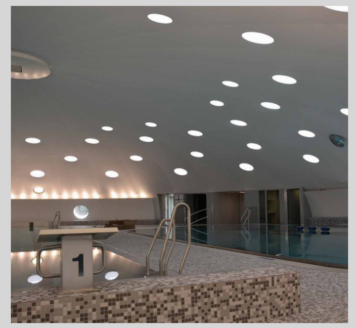
Lingolsheim Swimming - FRANCE