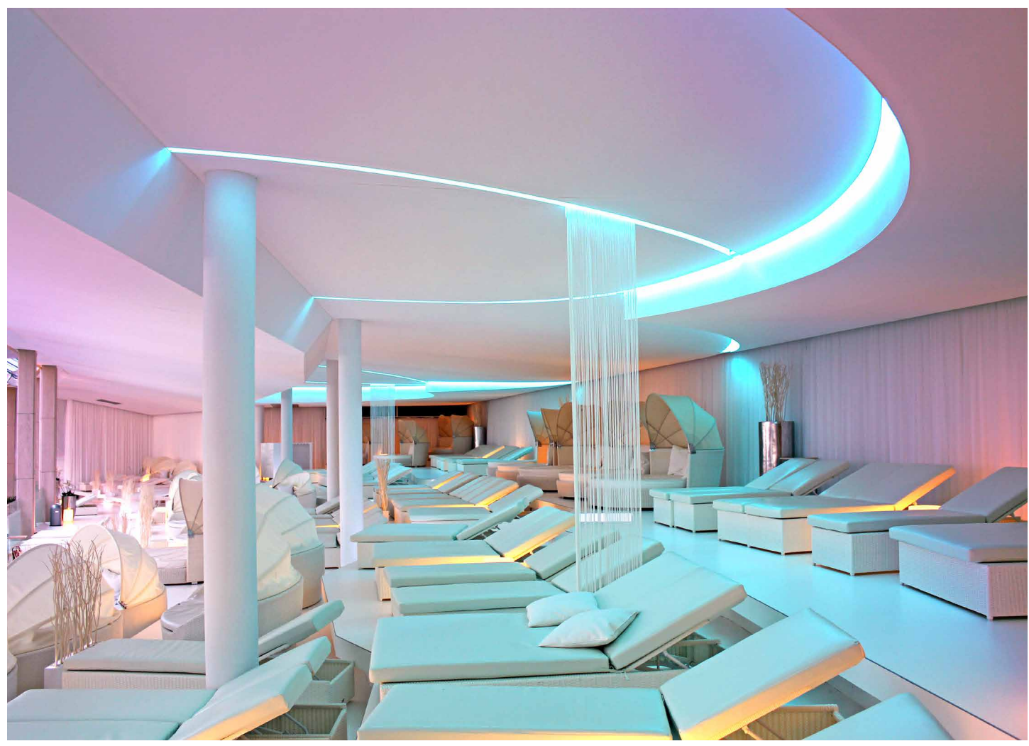
Badewelt Aquatic complex - Sinsheim - GERMANY