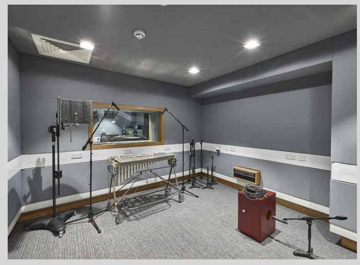
Recording Studio - UNITED KINGDOM - White ceiling and pearl grey acoustic walls - Installation: ACOUSTIC GRG