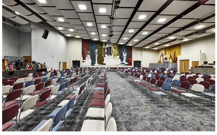
Auditorium (UNITED KINGDOM) Acoustic frames and printed walls Installation: ACOUSTIC GRG