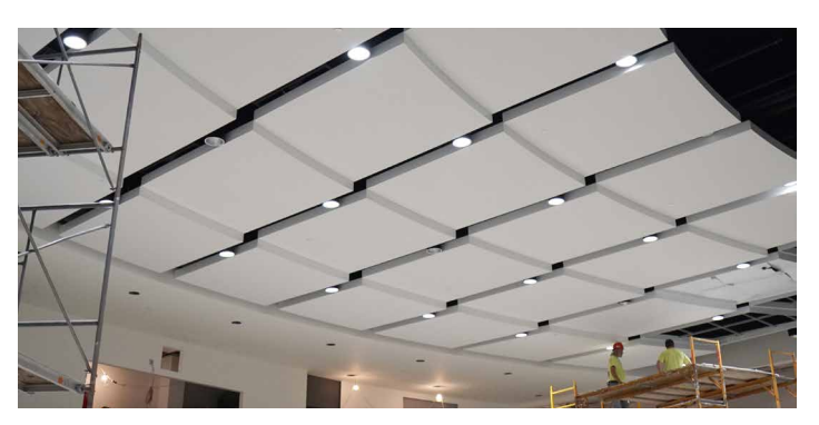
Ariel Corporation Auditorium - USA Custom acoustic frames, colour 'pepper' Installation: Ketchum & Walton Co.