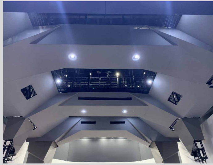
Ravinia Concert Hall • USA - Thunder grey acoustic covering with black profiles - Installer: The Huff Company Architect: BJC architects

You can also opt for light fittings to ensure comfort and harmony in all your rooms.