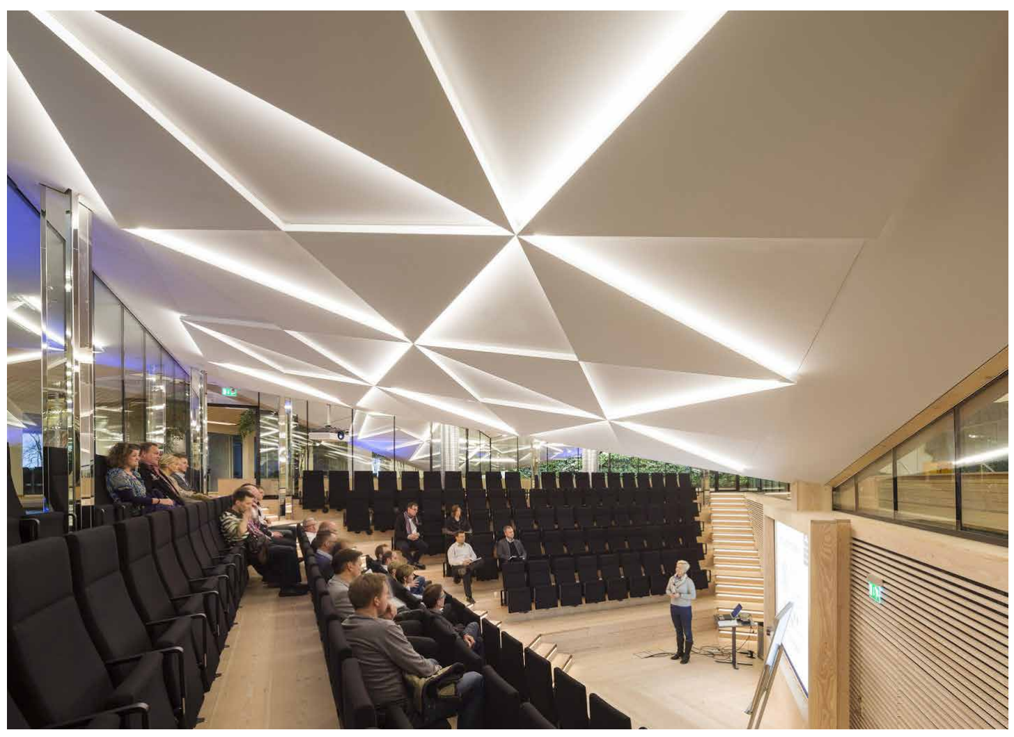
IBC Innovation Factory - DENMARK

Suspended acoustic cellings - Architect: Schmidt Hammer Lassen architects - Installation: Ralbo ApS