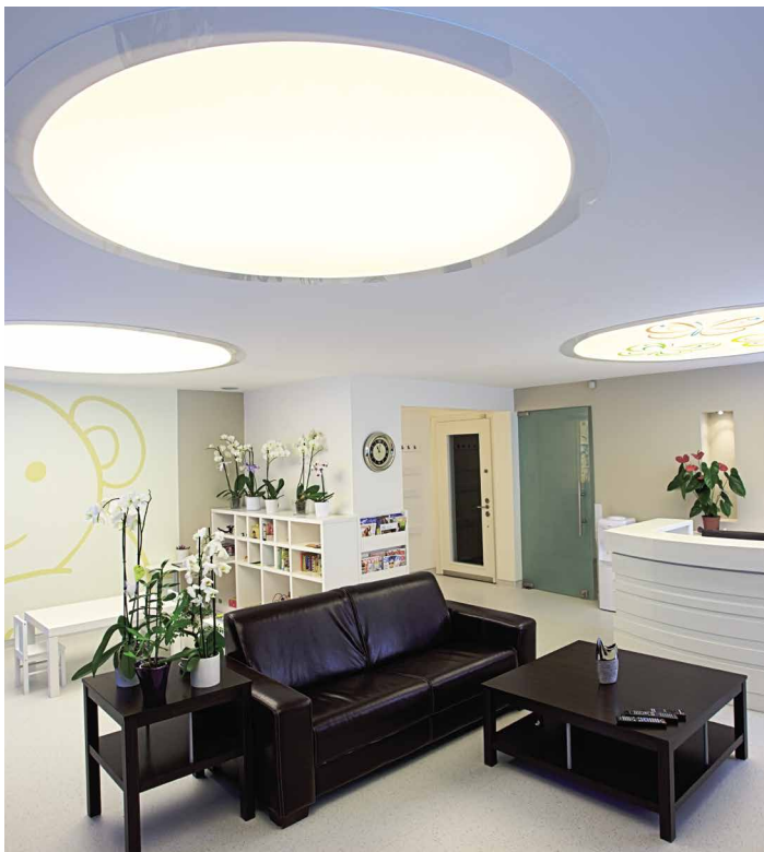
Waiting room of a medical practice - TURKEY

...CLIPSO® benefits for walls and ceilings in medical spaces: