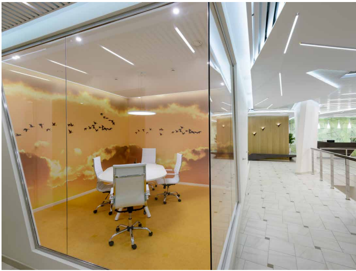
Medical Centre - RUSSIA Installation: CLIPSO UNION