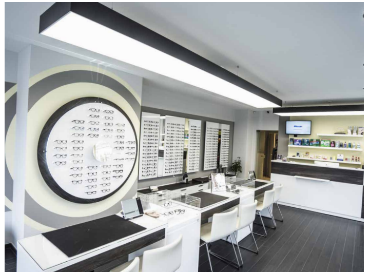
Optical store - LUXEMBOURG White ceiling and backlit frames Installation: Baumann Spanndecken GmbH