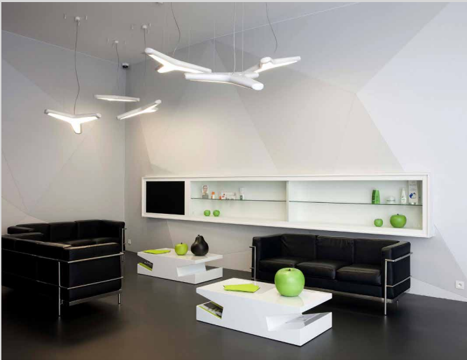
Waiting room of a medical practice - BELGIUM