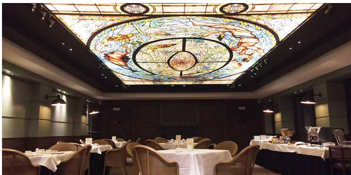
Restaurant - Belgium - Back-lit printed ceiling: MONAVISA

...for the advantages of CLIPSO® for walls and ceilings in hotels & restaurants