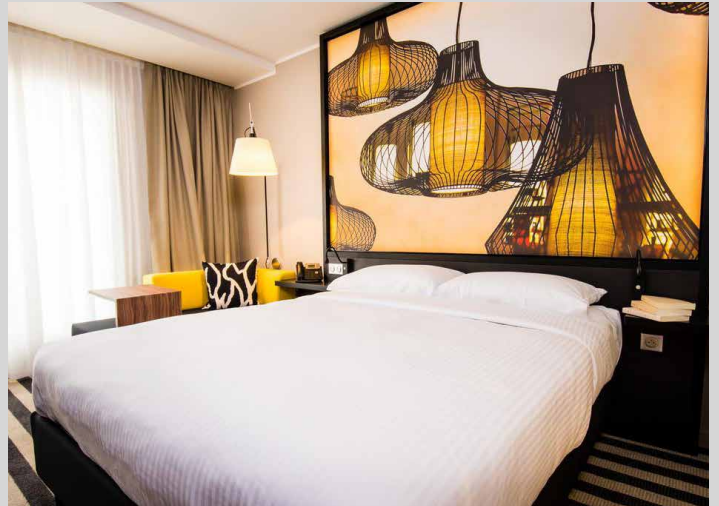
Pointe Simon Hotel - Martinique - FRANCE Printed backlit frames - Installation: DL2A