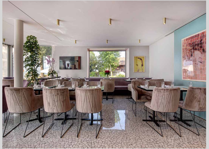
Hôtel du Léman - SWITZERLAND - White acoustic ceilings Installation: ABRIMUM