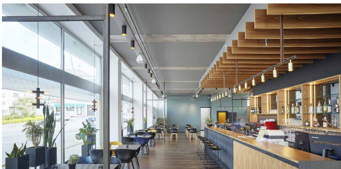
Bar - Restaurant - ICELAND - Colour acoustic ceiling Installation: ENSO