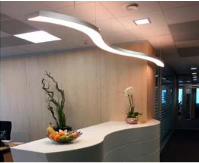
Backlit aluminum structures - Light Fixture - Switzerland Application : Linsi-tech

The compatibility of LED with our fabric gives you total customization: a printed coating with your choice of images or an artist's creation will create a unique atmosphere.