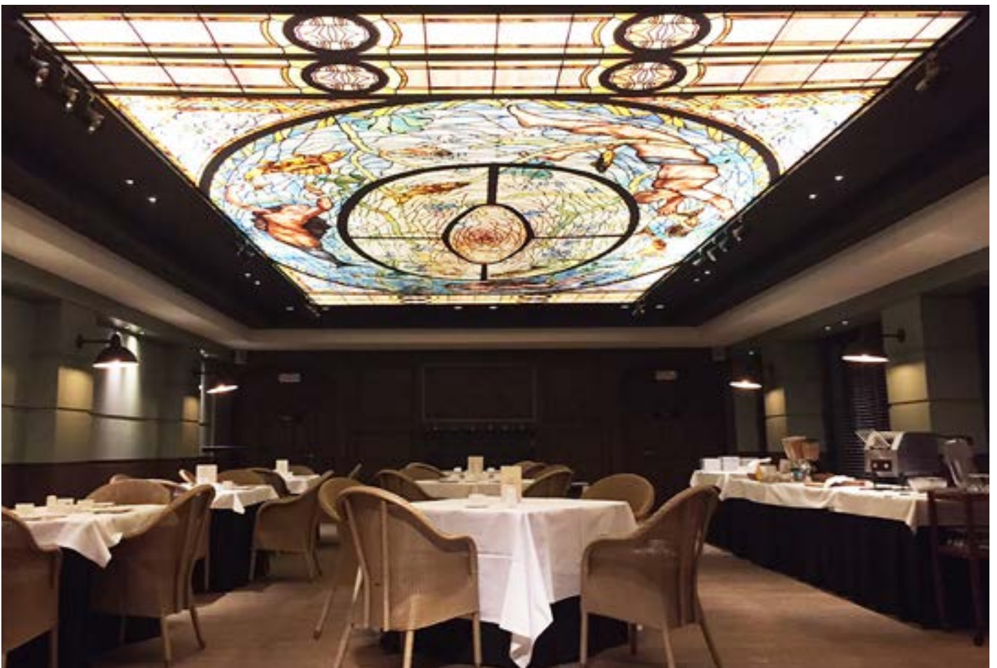
Restaurant - Backlit printed covering - Belgium - Application : MONAVISIA

This shape will be modern, elegant, aesthetic or refined ... Conform to your desires!