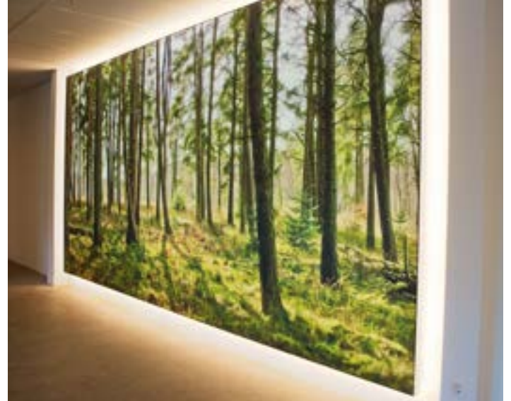
Wall box - Backlit printed covering - Belgium Application : City Outdoor

Want to play on light intensity or colors? Here again the association of a certain type of LED will allow you to create this soft and warm personalized atmosphere.